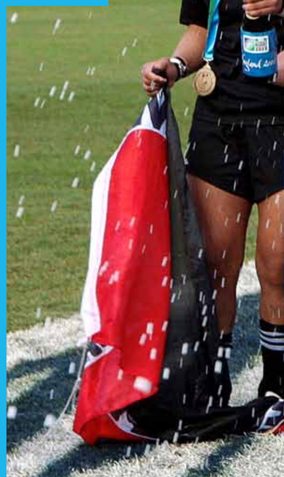
GREAT MOMENT THE BLACK FERNS CELEBRATE WINNING THE 2010 WORLD CUP.

"There's always been a dip, because of retirements, after World Cups," Rule says. "That's been a trend over the last 12